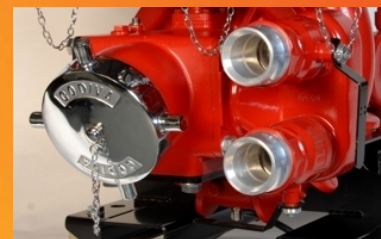
Integrated Collecting Head (optional extra)