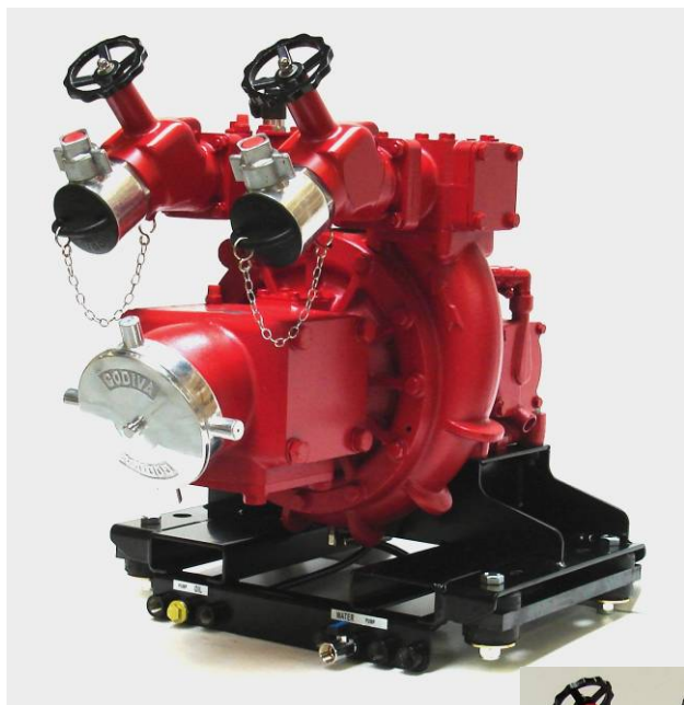
Model shown: P1A series pump